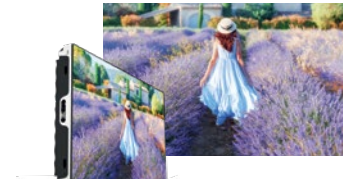
L-Line FHD kits