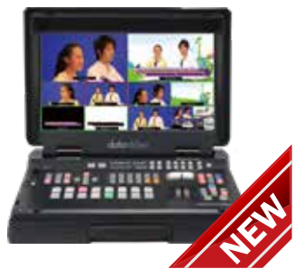
HS-1300 6 Input HD Mobile Studio