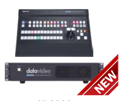
SE-3200 12 Input HD Switcher