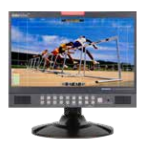
TLM-170P/PM/PR 17.3" HD/SD Monitor