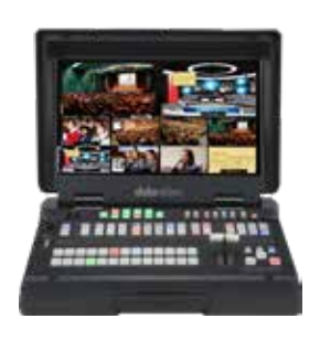
HS-2850 8 to 12 Input HD/SD Mobile Studio