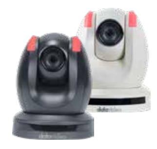
PTC-150T 1080P HDBaseT Camera