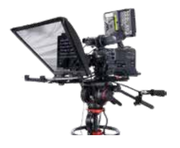
TP-650 Large Screen Prompter Kit for ENG Cameras