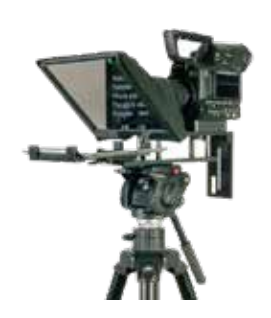
TP-300 Tablet Prompter