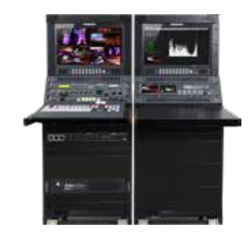
OBV-2850 8 to 12 Input OB Van Studio