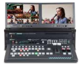
GO 1200 Studio 6 Input HD Studio