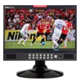
TLM-170L/LM/LR 17.3" HD/SD Monitor