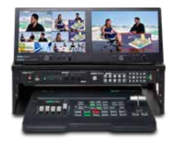
GO 650 Studio 4 Input HD Studio