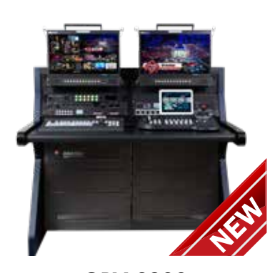
OBV-3200 12 Input HD OB Van Studio