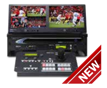
GO KMU-100 Studio Virtual multicam studio