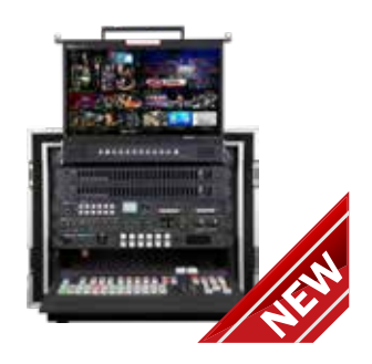
MS-3200 12 Input Flyaway Studio