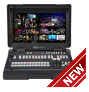
HS-3200 12 Input HD Mobile Studio