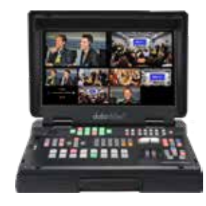
HS-2200 6 Input HD/SD Mobile Studio