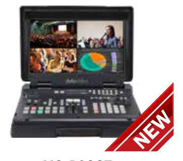
HS-1600T 4 Input HDBaseT Mobile Studio