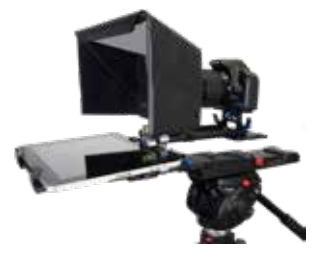
TP-500 DSLR Prompter