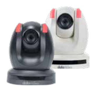
PTC-150 1080P Camera