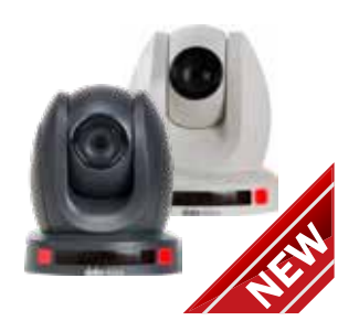
PTC-140T 1080P HDBaseT Camera