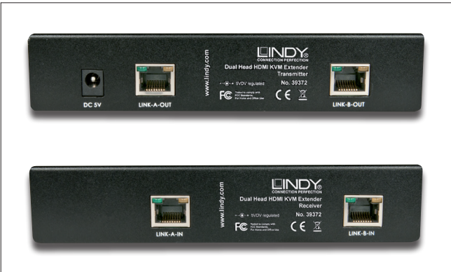
Transmitter & Receiver Rear View